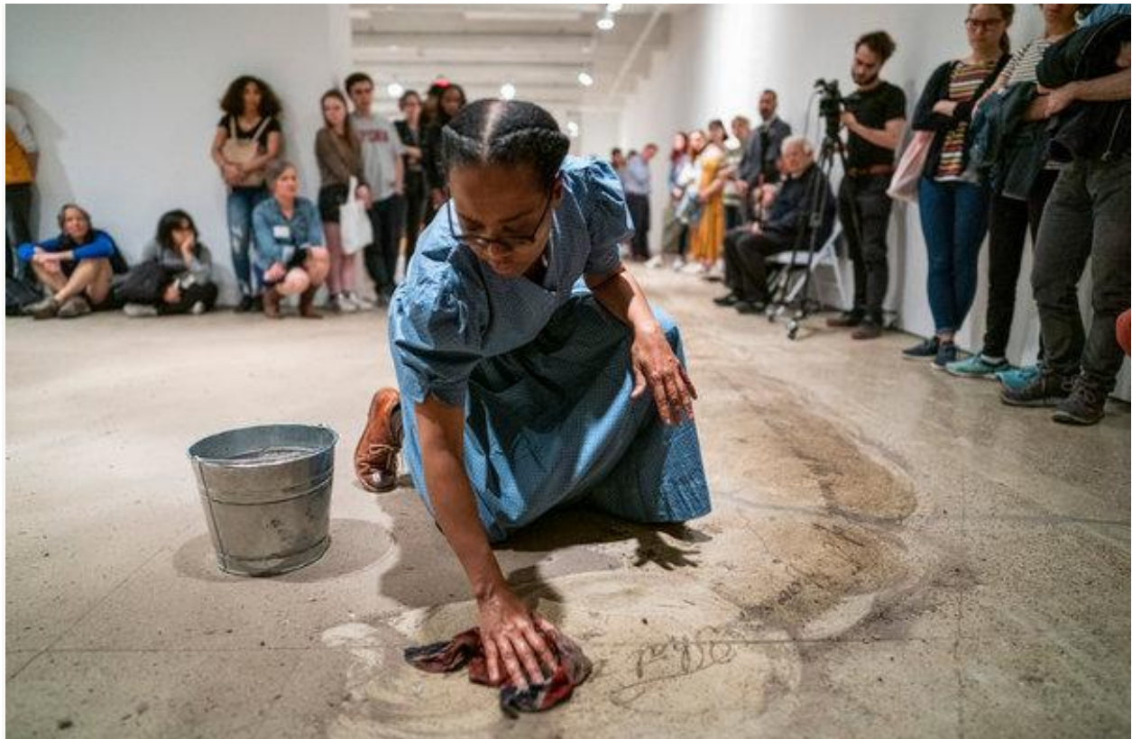
The artist Sonya Clark performs, mopping up dust with a dish towel printed with an image of the Confederate battle flag. The dust, on a section of the Declaration of Independence inscribed on the concrete floor, came from historic sites in Philadelphia.

PHILADELPHIA — In a second-floor gallery at the Fabric Workshop and Museum here on Saturday, a woman used a dish towel printed with an image of the Confederate battle flag to clean a layer of dust from a section of the Declaration of Independence inscribed on the concrete floor.