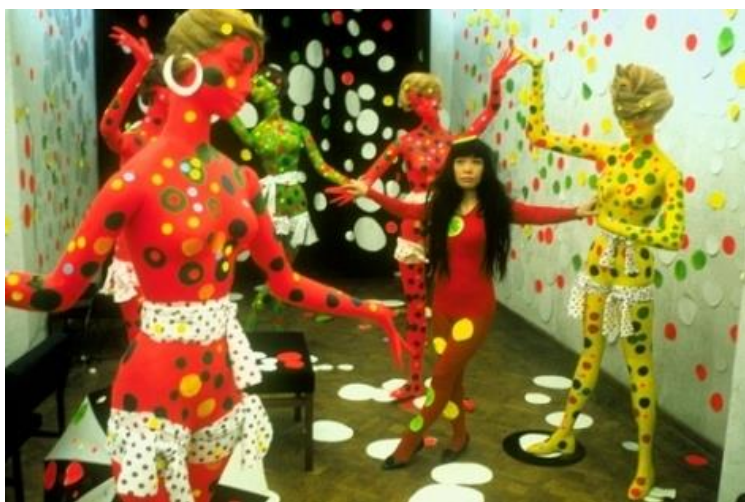
Film Still from Kusama—Infinity: The Life and Art of Yayoi Kusama.