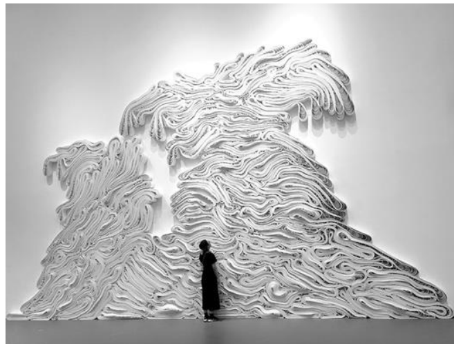
An installation view of Jae Ko's rolled-paper sculpture "Flow," on view in the exhibition "Fields and Formations A Survey of Mid-Atlantic Abstraction" at the American University Museum.

The second show, "Fields and Formations: A Survey of Mid-Atlantic Abstraction," is a version of one that previously ran at the Delaware Contemporary, a Wilmington art space. It presents work by 12 female and nonbinary artists from the Mid-Atlantic region, several of whom will be familiar to regular D.C. gallery visitors.