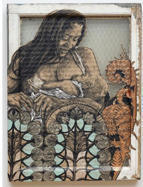
"Dawn and Gemma," by the artist Caledonia Curry, who works under the name Swoon.

Among the artists who focus on the body are two of the show's best-known artists — Louise Bourgeois, who died in 2010, and Judy Chicago — as well as Wangechi Mutu. Chicago's symbolic renderings of female genitalia are sleek and cleanly designed, suggesting less human flesh than the machine-tooled plastic abstractions of her early career. Mutu, however, evokes physical frailty with prints of faces superimposed on 19th-century medical illustrations of uterine tumors.