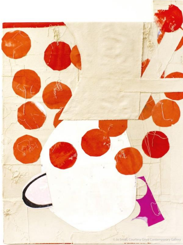
Jo Smail – Bubbling-Up