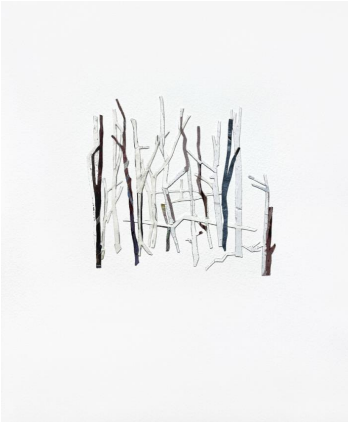
"Paper Forest Series #3," Mixed media collage on paper

menace? Or does it merely reference pulp magazines, popular during the mid-20th century, that the film's own title was based upon?