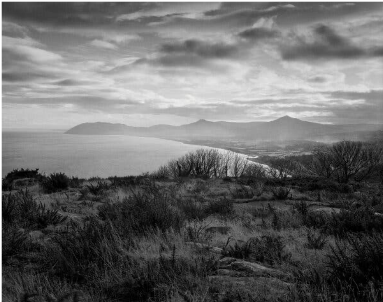
A view from Killiney Bay.