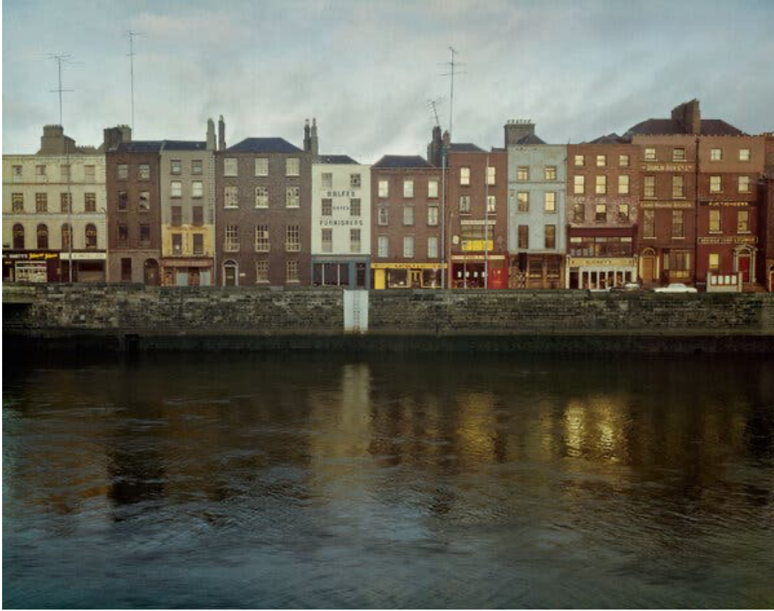
Reflections in "The Quays."