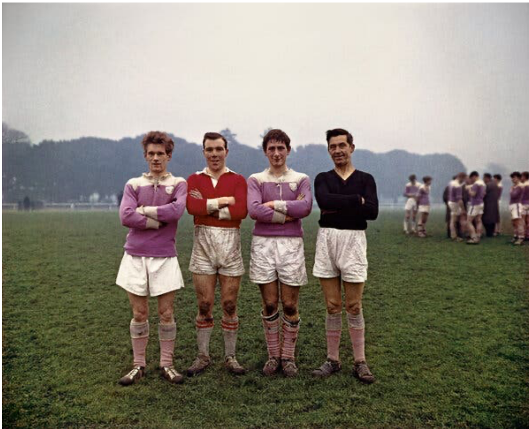
Muddy soccer players in Phoenix Park.