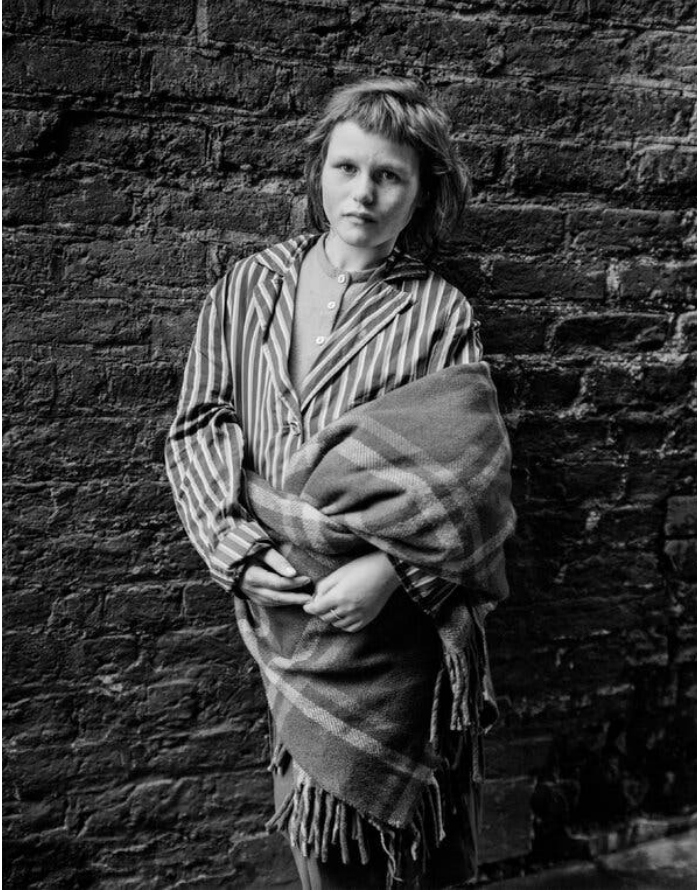
"Tinker Girl."