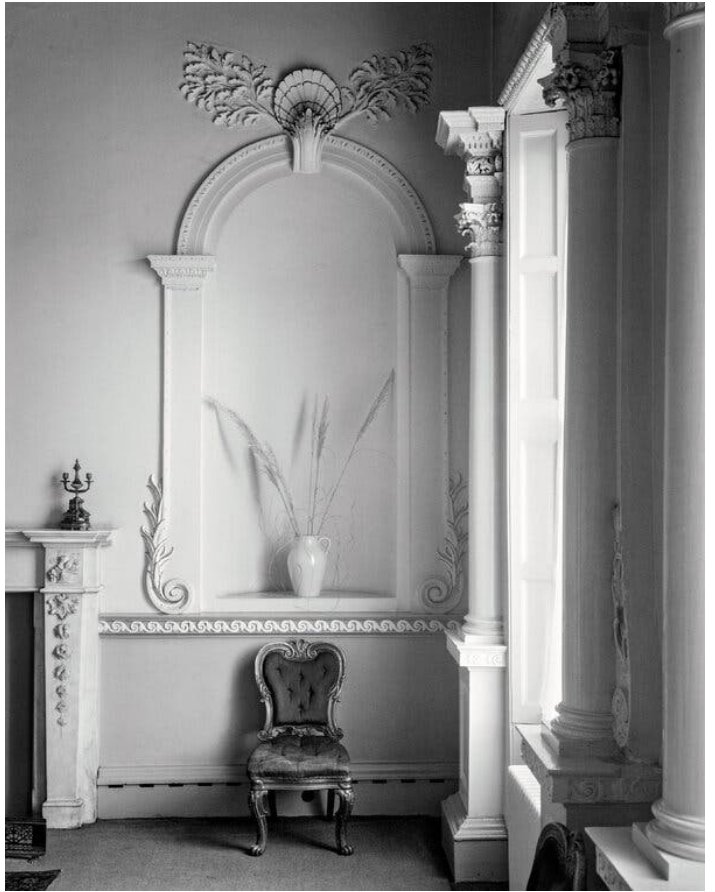
85 St. Stephen's Green, University of Dublin.