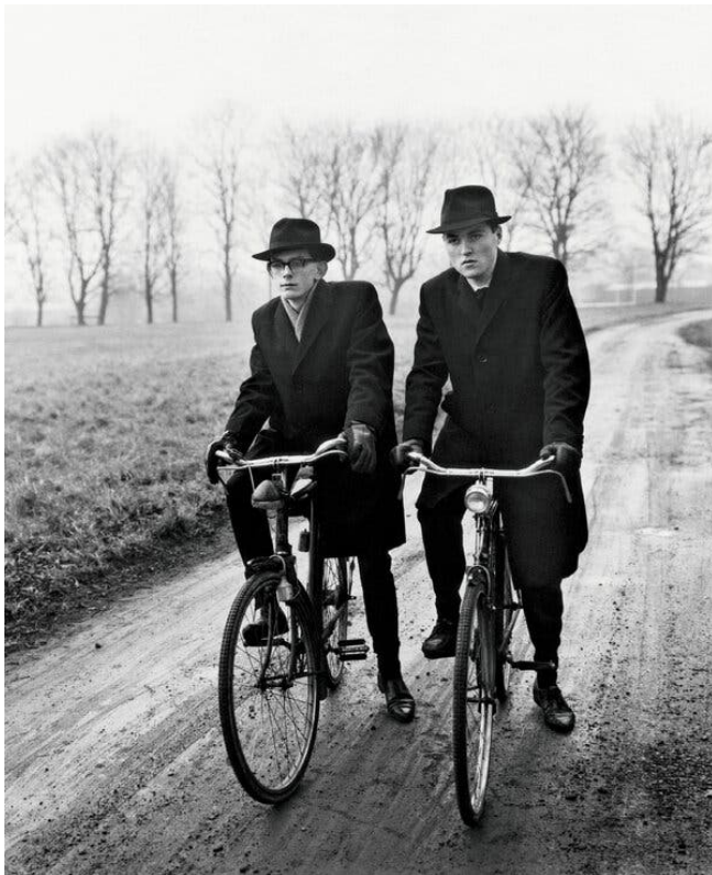
A pair on bicycles in "Seminaries."