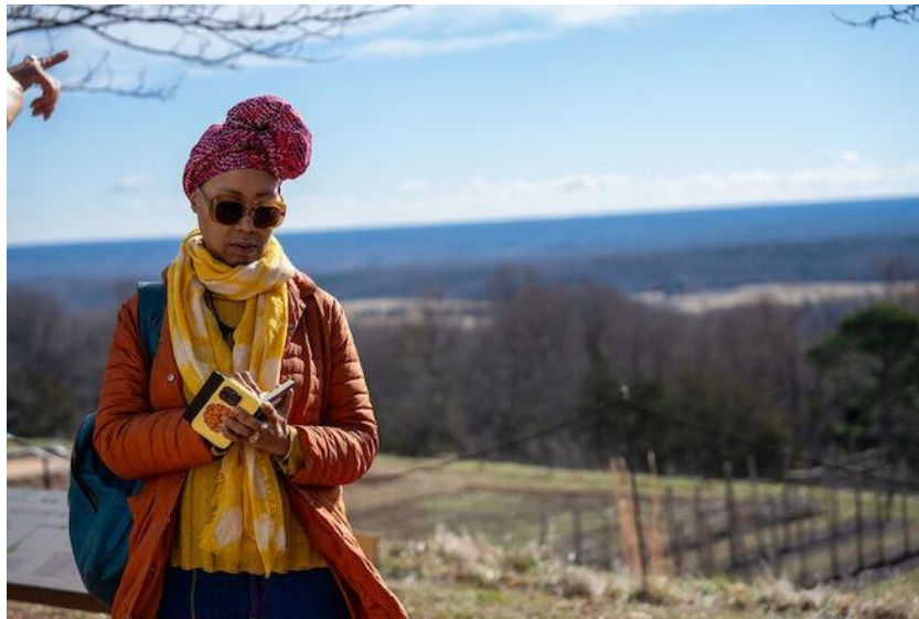
Monticello site visit.

I wish I was standing on the corner all the time, because people's responses lead to important critical questions.