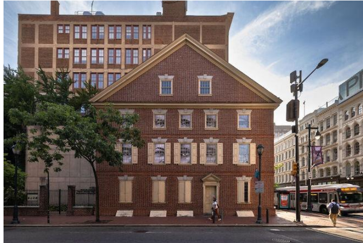
A view of Sonya Clark's "The Descendants of Monticello," from the 7th Street side of the Declaration House at Independence National Historical Park.