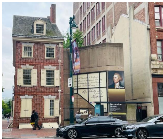
Declaration House before the installation, as viewed from Market Street.