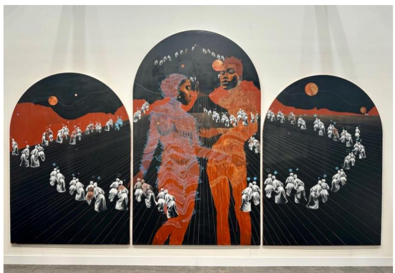
Southern Guild